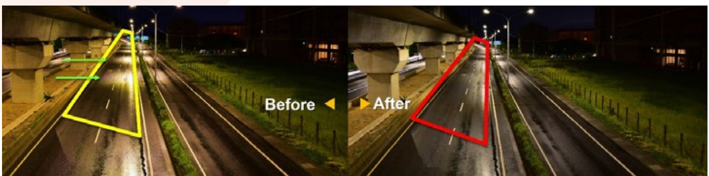
Comparison between human-centric lighting systems and normal street lights on a rainy day.