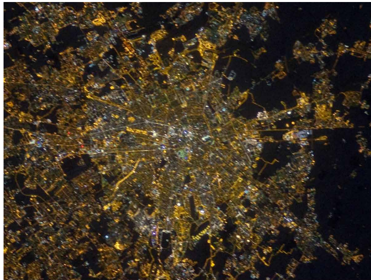
Figure 2: Changes to cities that have adopted LED for municipal street lighting are literally visible from space. The city of Milan, Italy is shown here at night in images taken from the International Space Station before (2012, top) and after (2015, bottom) the conversion of the city center's lighting from an existing high-pressure sodium system to white LED. The new lighting system makes central Milan noticeably more blue at night