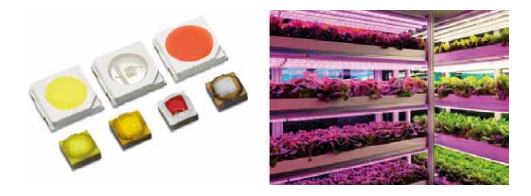
Figure 2: The LUXEON SunPlus horticultural lighting solutions from Lumileds.

Greenhouse lighting typically consists of high bay LED fixtures in either full-spectrum daylight substitution (enabling more grow cycles within a year), or targeted wavelengths (to improve crop yields and quality). In one trial in the Netherlands, where PAR-focussed Plessey Hyperion modules were specified, 35% better yields were witnessed than had been possible with traditional HPS-based horticultural lighting.