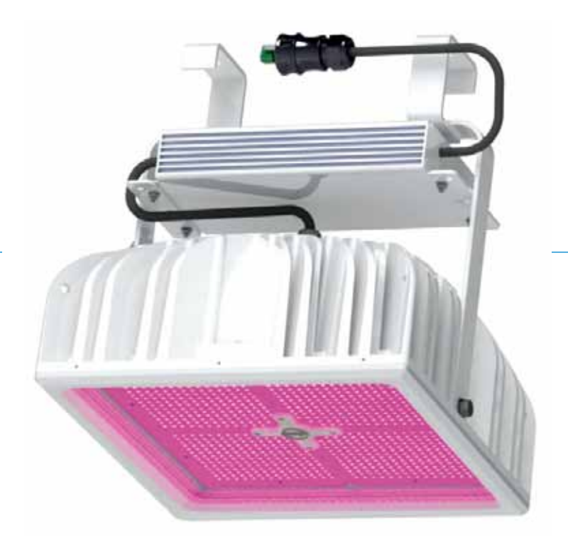
Figure 1: Plessey's Hyperion horticultural lighting modules.

LED lighting also provides far greater control over lighting quality, spectral output, directionality and spread than HPS lighting sources. Whereas HPS bulbs output light in all directions, LED light sources can be much more targeted. Lighting is generally output at 180 degrees, and the beam can subsequently be focused or spread to the desired angle and distribution using appropriate LED optics. By controlling beam spread, lighting can be concentrated on just the plant/s - thereby reducing wasted light. In addition, careful choice of LED lighting and optics can allow growers to adjust the spectral output of the LED lighting over time. Since different stages of plant growth are boosted by certain wavelengths, spectral output can be chosen to accentuate growth during each stage.